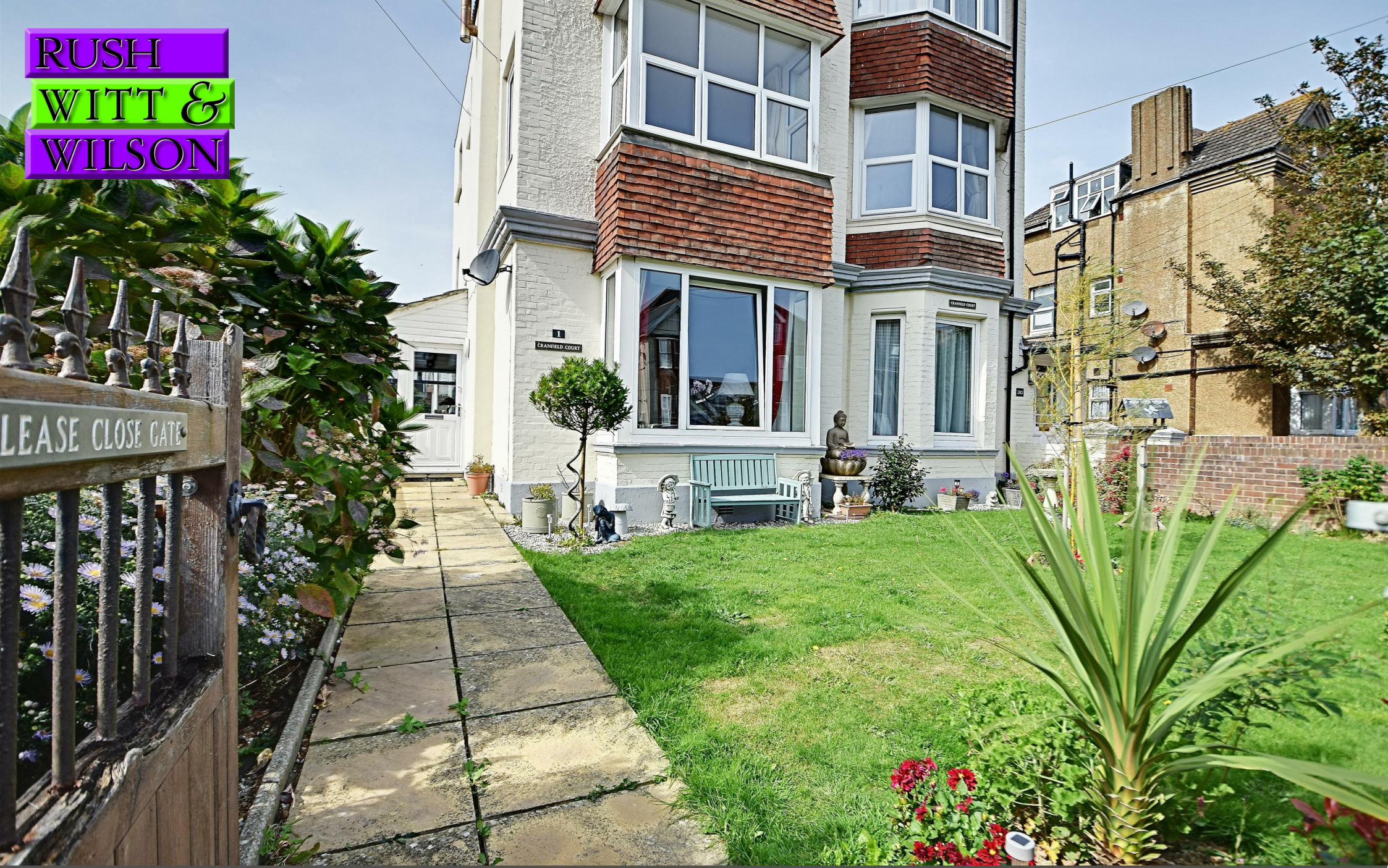
1 Cranfield Court Cranfield Road, Bexhill-On-Sea, East Sussex TN40 1QB £325,000